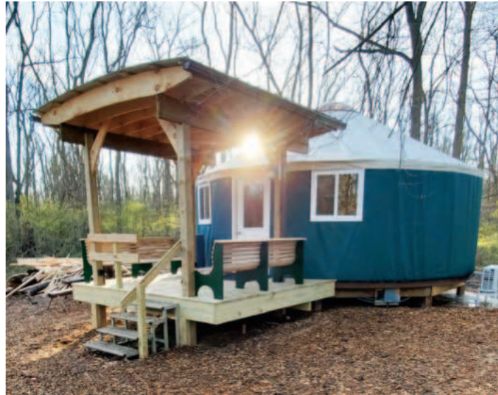
Sunrise over the new yurt