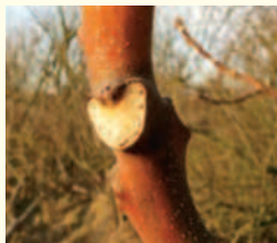
Large V- or heart-shaped leaf scars are another key indicator of this species.

to set an ecosystem back on a course towards being a healthy oak-hickory forest.