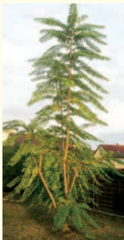
The thin, upright growth of Ailanthus is rapid, with alternate twigs whose bark, when scratched, has a scent that resembles burnt peanut butter.