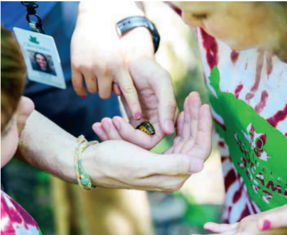
Camper's curiosity grows with observation and exploration.

anniversary of Glen Helen's Ecocamp! Since 1972, Ecocamp has been a staple for children from throughout the region and beyond. This program has evolved over time, but has always held true to its core mission of joyfully cultivating nature connection and community amongst our campers, families, and staff. While we're constantly looking for ways to improve, if you look back through old files or hear stories from former campers, it is amazing to me how much of our program is steeped in tradition. We're still using the same daily camp schedule, campers still 'caterpillar walk' cooperatively, are challenged to limit their wasted food, and sing the Yellow Springs Song a handful of times each week. While we no longer handwrite our attendance lists (thank goodness!) and parents complete a bit more pre-camp paperwork (sorry!), we still welcome each of our campers for a week of immersive exploration in the beautiful forests of Glen Helen.