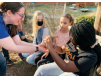
Environmental education programs are up and running