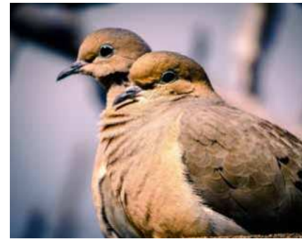
Red Costa Rican doves

So what does this have to do with the title of the article? Well, a true wildlife rehabilitator never finds oneself too far from the job. While exploring the Costa Rican cloud forest, we were delighted by the free flying butterflies and birds. There were a number of rusty red Costa Rican doves that were primarily ground dwelling, but would dash up for a quick flight if a passerby got too close. We just passed a display of chrysalises and took the elevator to the upper walkway when my husband pointed out a dove lying awkwardly on the ground where we had just walked. We watched it for a minute, but once it moved its head we figured it was fine. Just