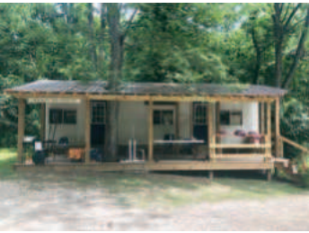
The new porch at the Outdoor Education Center office

We are glad to support such an important ecological gem and help preserve it for future generations! 🌿