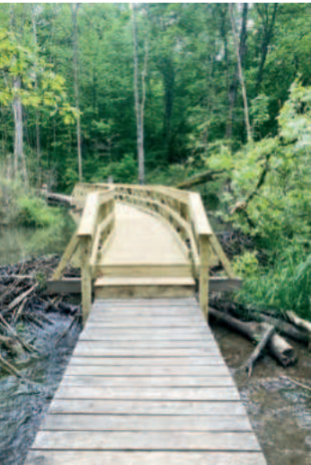
Beaver dam boardwalk