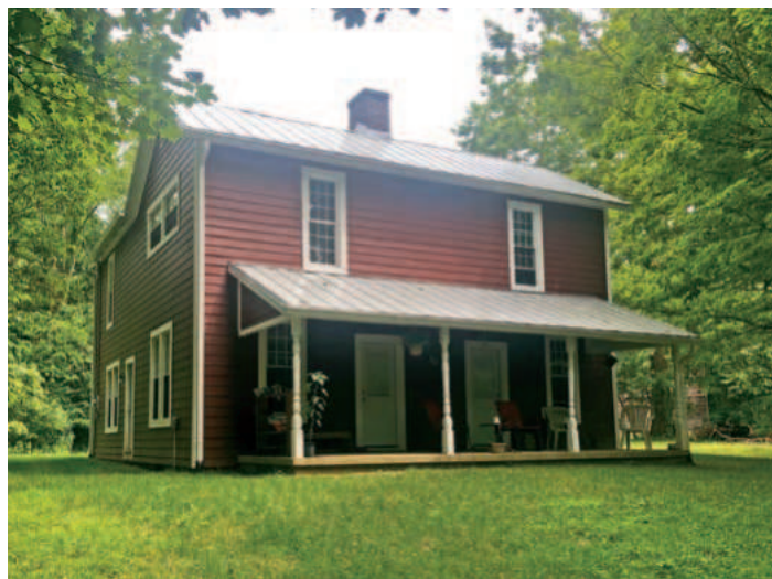
The Mercer Farmhouse, before and after