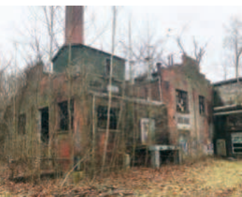
The derelict power plant.