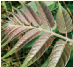
Tree of Heaven's pinnately-compound leaves can grow from 1 to 4 feet long and can have from 10 to 40 leaflets.

I hope to supplement this ecosystem's vegetative re-establishment through additional native plantings and continued invasive species management and monitoring. This is what it takes to secure healthy forest ecosystems and