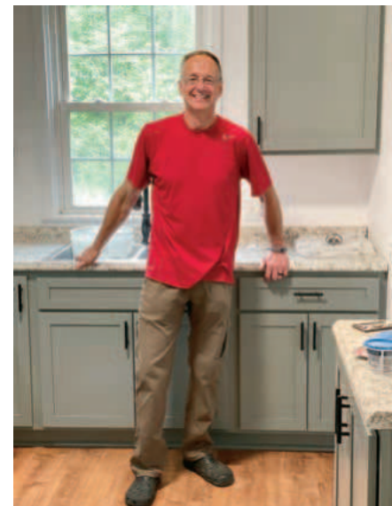
The kitchen, before and after