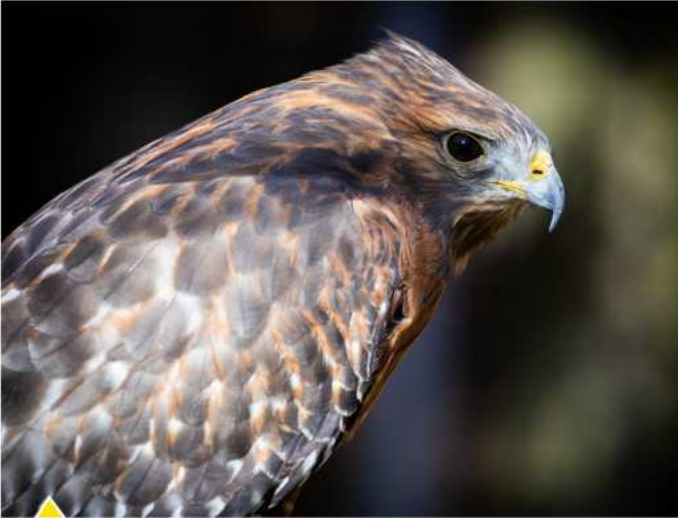
Last photo taken of Eileen.

In the last several months, a common question asked at the Raptor Center has been, “What happened to Eileen?” Fear not! The answer is joyful, if unplanned. Eileen the Red-shouldered Hawk came to the Raptor Center in the late summer of 2017 suffering from West Nile Virus. West Nile is a serious condition for raptors. It is typically spread by mosquitoes and causes brain swelling, loss of coordination, head tilt, tremors and lethargy. Most birds that contract it die without treatment in 3 weeks or less.