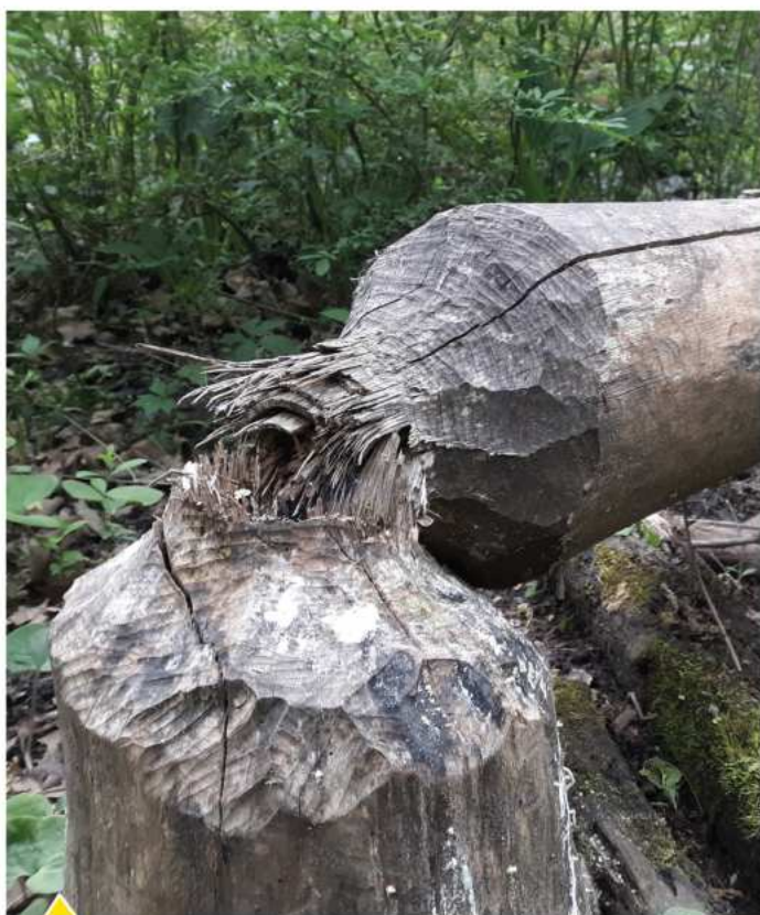
Resident beavers handiwork.

At a time when humans are transforming natural landscapes so dramatically that one million species of plants and animals are at risk, our supporters are ensuring that Glen Helen remains a stronghold for nature. Thanks to these Glen friends, we have created transformations to support thriving ecosystems while enhancing environmental education for our visitors.