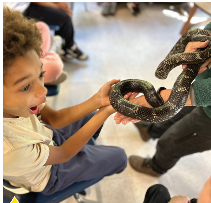
The ambassador animals help ease fears and correct misinformation. Students' connection with these animals can lead to a greater compassion for all types of nature.