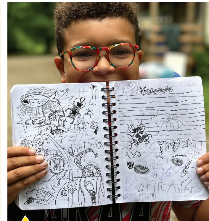
Outdoor School naturalists and Ecocamp counselors receive high quality training giving them the skills to bond quickly with students and provide a safe and supportive learning environment.

Today's transformative experiences are unique. There are no screens at the Outdoor Education Center. No video games, no handheld games, no YouTube, no social media, no podcasts! Students' brains have a chance to bounce back from the physical and psychological changes incurred by too much screen time. Students are able to make eye contact and speak aloud to other students. They play games together, learning how to negotiate, practice taking turns, and engaging with their feelings.