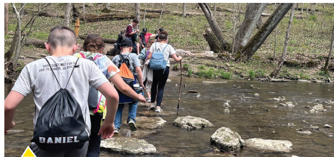
Students may have lots of "firsts" when visiting the Outdoor Education Center. This adventure could be the first time crossing a stream, first time getting feet wet, first time navigating stepping stones, or all of those things at the same time.

Today's transformative experiences are repeatable. During Outdoor School, teachers are seeing their students in new ways. Students who struggle within the confines of the traditional classroom blossom when participating in nature-based learning. Students are often calmer, more focused, and engaged. Teachers who bring their students to the Outdoor Education Center experience this year after year! They are always just as pleased and encouraged each time it happens. The fact that this happens every time does not diminish the joy it brings.