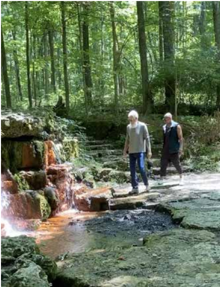
David Letterman visited the Yellow Spring with Dave Chappelle, as part of the Netflix program "My Next Guest Needs No Introduction."

We were recognized as Partner of the Year by the Greater Dayton Partners for the Environment.